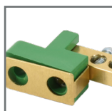
TBJ-6x09: additional grounding