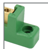
assembly to the switchgear housing