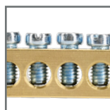
brass flat bar