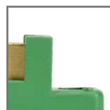
insulation colour: green